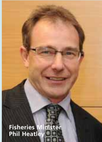
Fisheries Minister Phil Heatley

He says fisheries management is tilted towards the commercial seafood industry, “with little to no support for actively managing the public’s interests.”