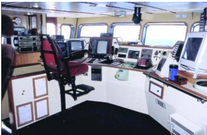
The fisherman's wheelhouse has every electronic aid

I have yet to describe successfully what happened to me that night, as it was one of those situations that have to be experienced to appreciate what it was like. But as it was the most terrifying experience that I have ever had, I don't recommend it!