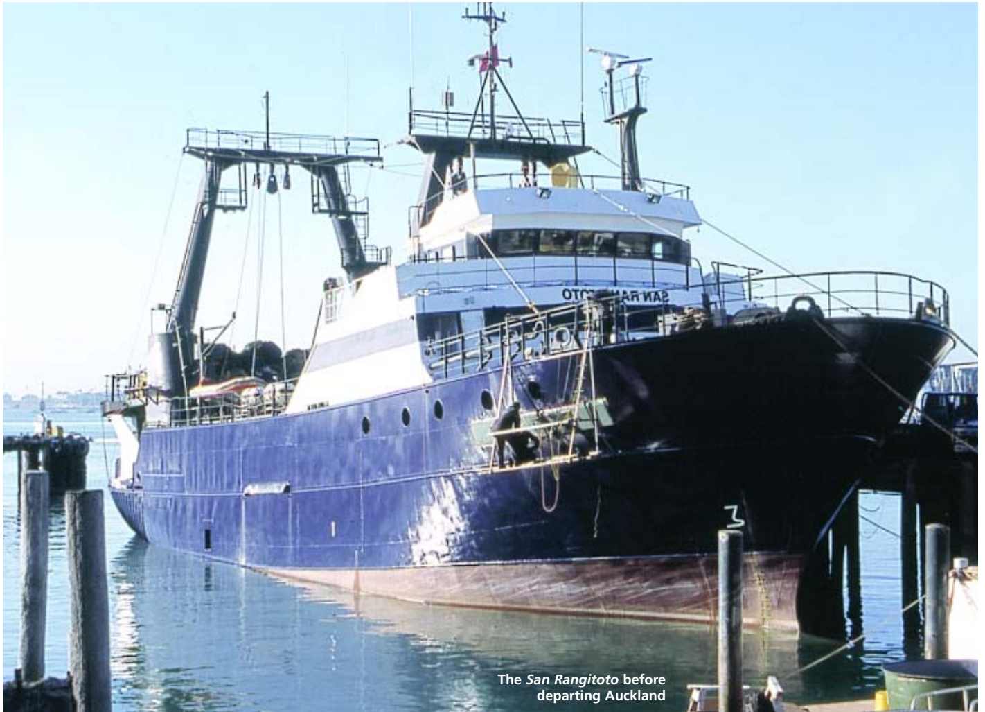
The San Rangitoto before departing Auckland