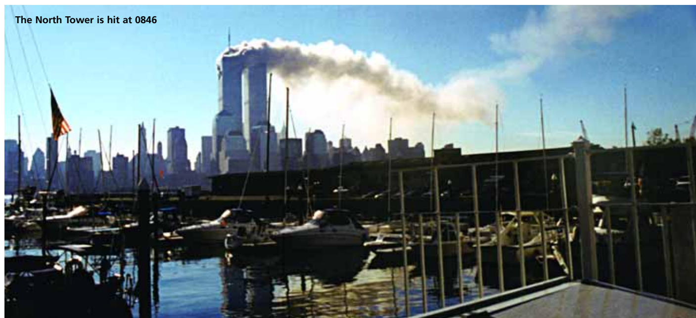
The North Tower is hit at 0846

We were watching a surreal scene. Two of the tallest ►