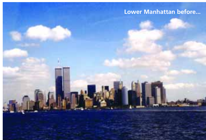
Lower Manhattan before...