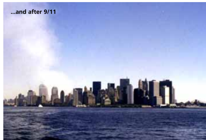
...and after 9/11