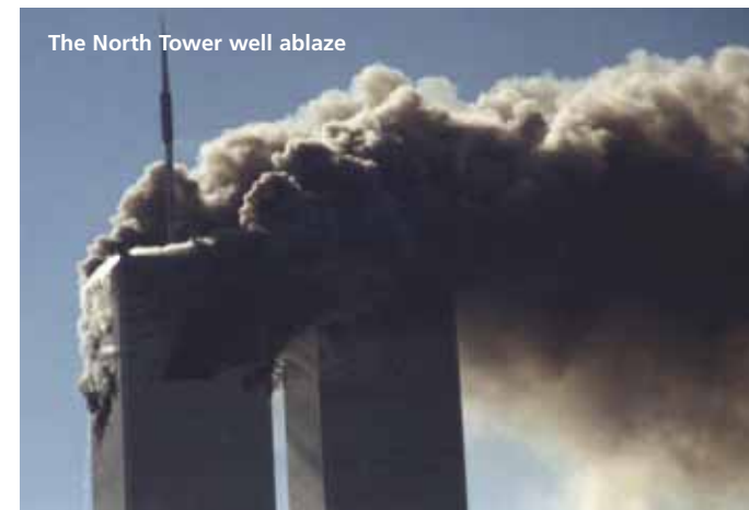
The North Tower well ablaze